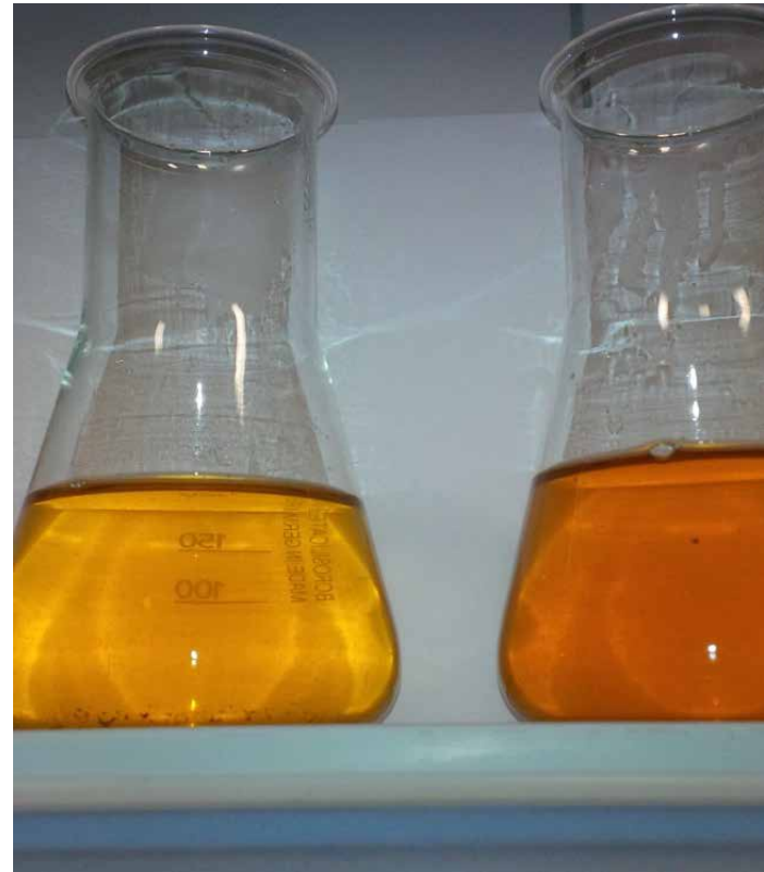
Deaerated apple juice (left) and non-deaerated apple juice (right)